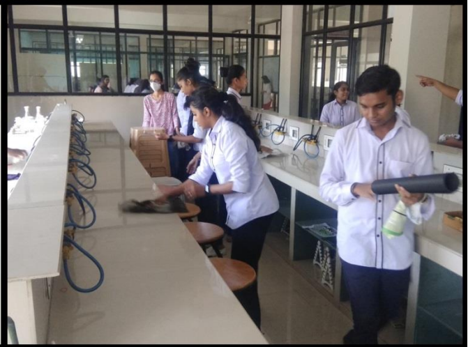
Representative photos of students participated in swachhaata abhiyan.