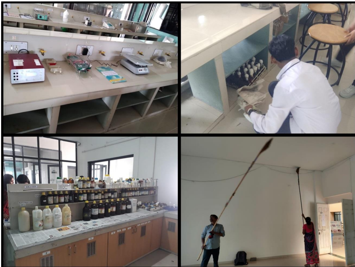
Representative photos of students and non-teaching staff cleaning reagent preparation room, classroom 4 and practical lab.