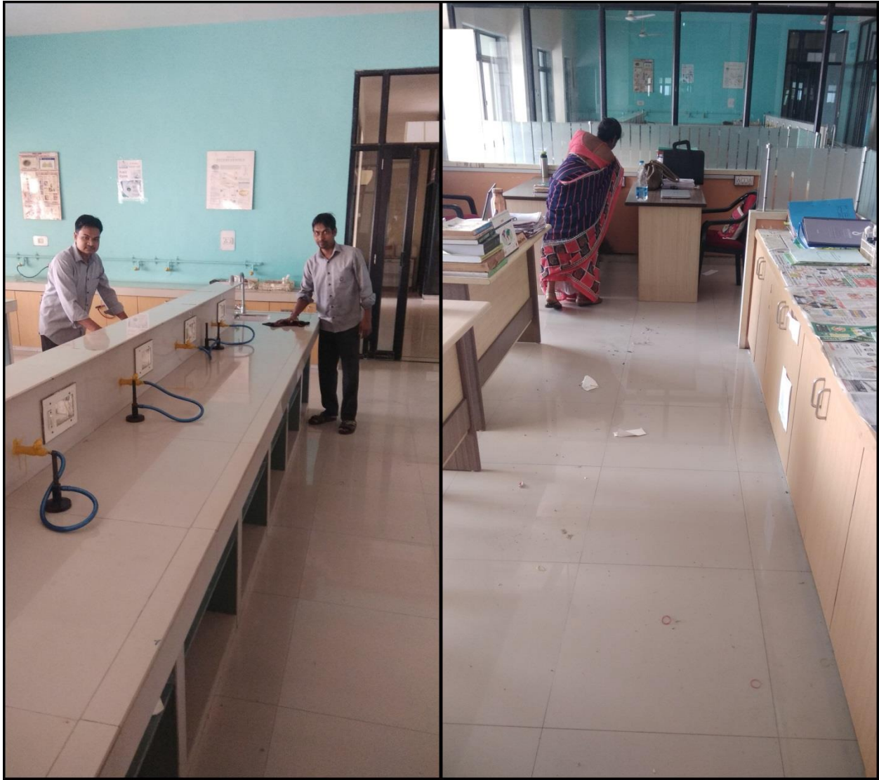
Non-teaching staff in action....