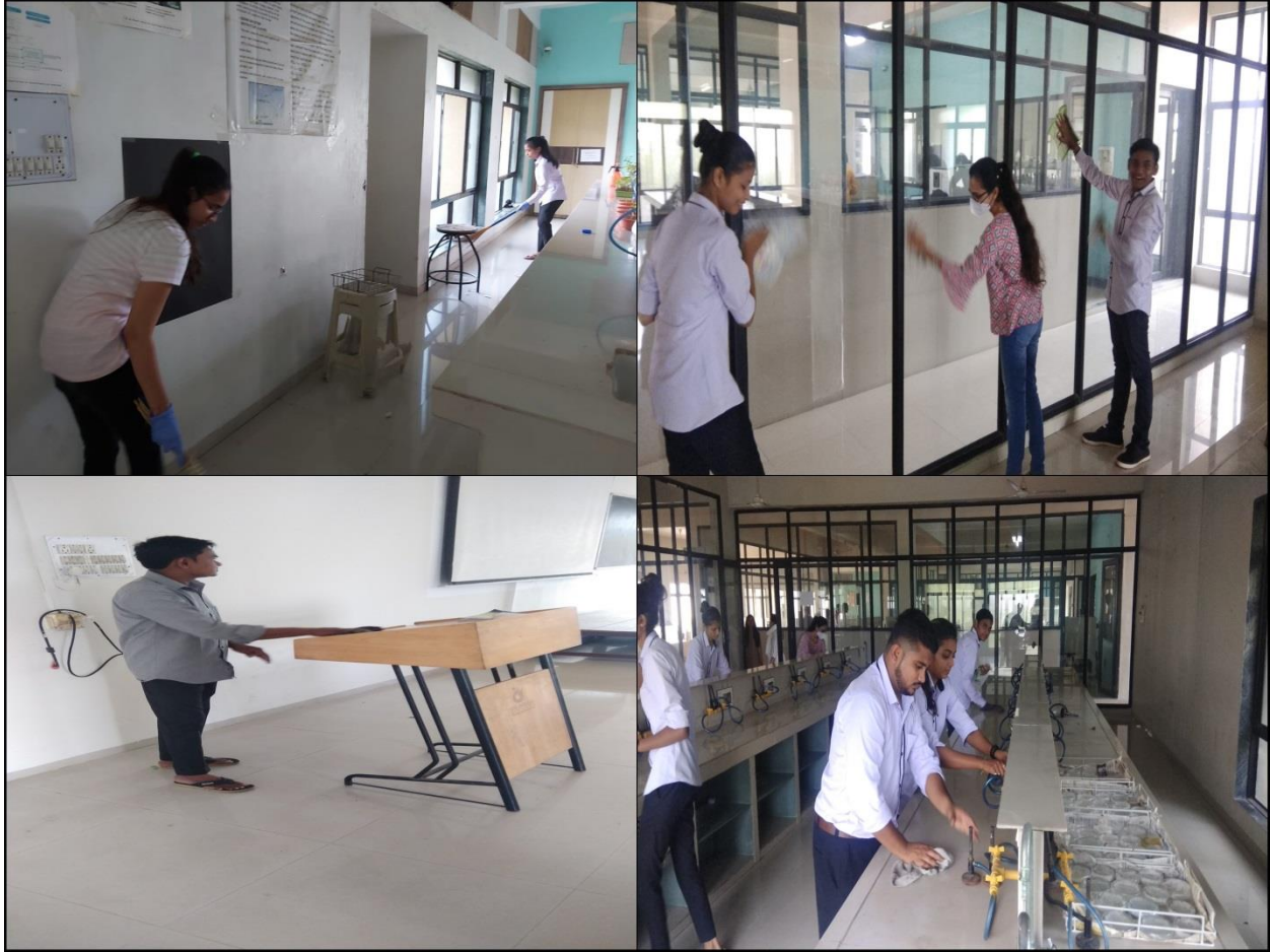
Representative photos of students and non-teaching staff performing cleanliness in first floor.