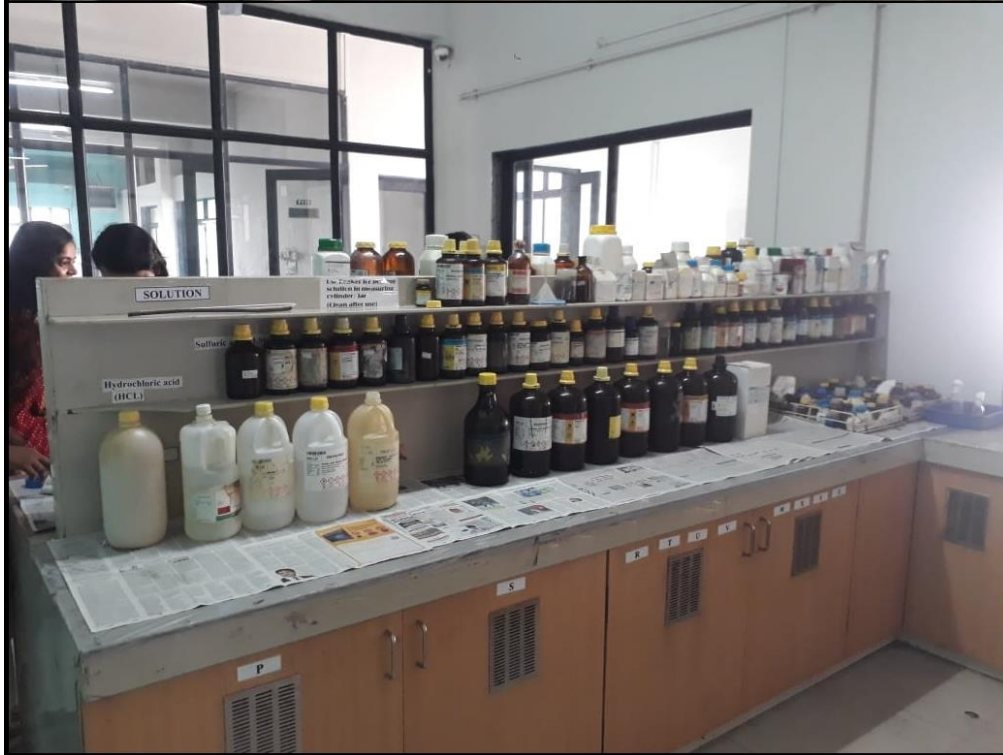
Systematically arranged solutions and equipment's after cleaning.