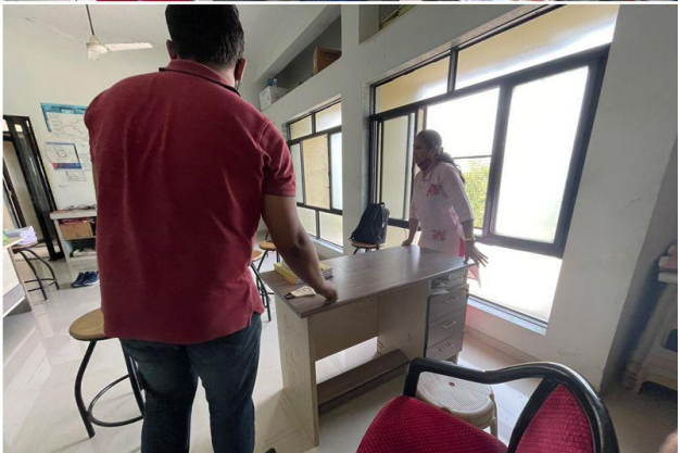
Students cleaning and arranging working platform and ceiling fan